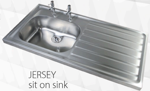
JERSEY sit on sink