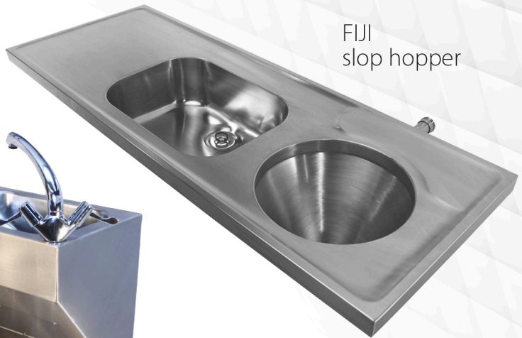
FIJI slop hopper