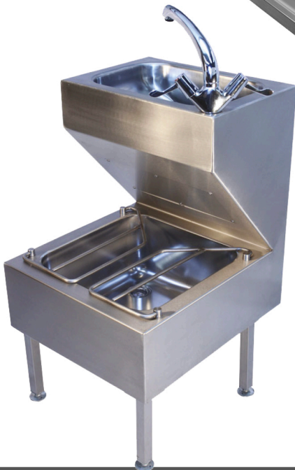
SAMOA janitorial sink