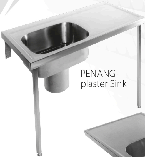
PENANG plaster Sink

We've been manufacturing stainless steel products for over 100 years. We make our products in Leeds and offer a speedy delivery to our UK customers. Check out these popular selling healthcare lines.